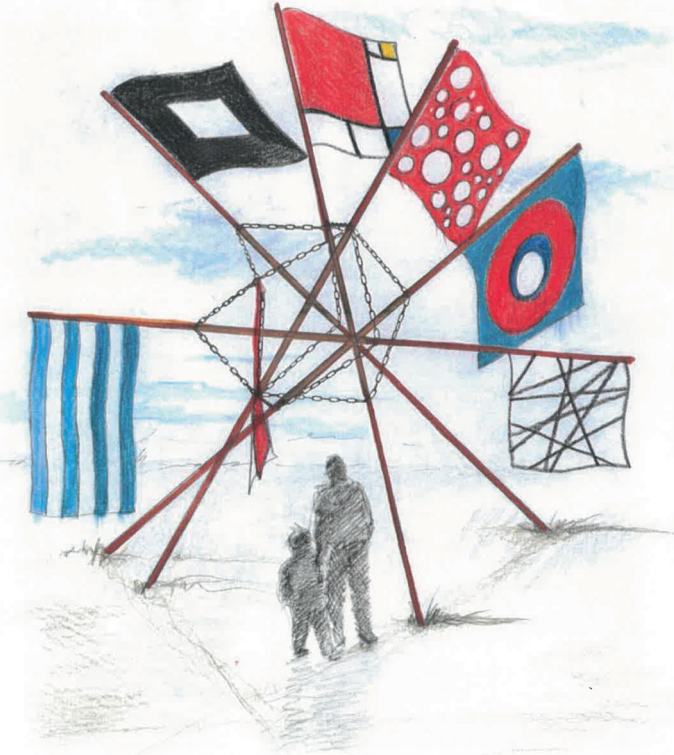
La bataille des avant-gardes , Vincent MAUGER Preparatory sketch of the work exhibited in the garden of Château royal d'Amboise. © Vincent MAUGER

The installation La bataille des avant-gardes unfolds in the park of the royal castle. Produced for the site, it challenges traditional architectural construction techniques by relying on the principle of self-tensioning structures developed by DG Emmerich (architect, etc.). Aerial volume, bristling with tubes and chains, the artist adds to history flags similar to the banners of the lords, while defining the vanguards of the history of 20th century art.