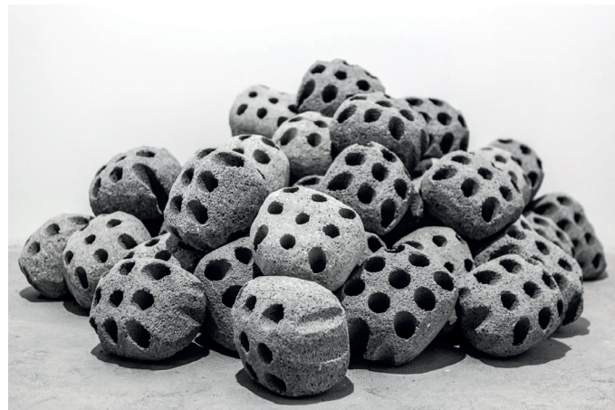
Sans titre , Vincent MAUGER, 2018, sculpture, 1,5 x 1,5 x 0,8m, Cut concrete bloc.

With regard to his volume work relating to space, he also responds to several public commissions (Cholet, Orléans, Montreuil, Turcoing, etc.).