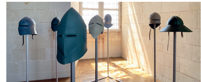
Sans titre , Vincent MAUGER, 2019, installation, great helm replica painted to the colour of military armoured vehicle. Aluminium and steel stand. © V. MAUGER