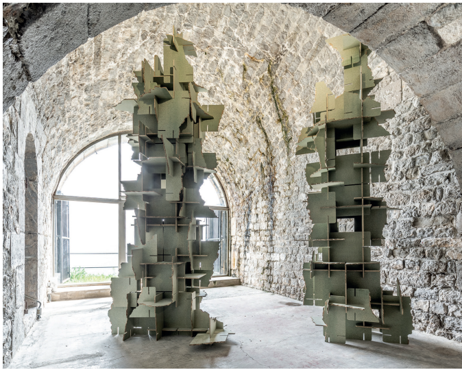
Sans Titre , Vincent MAUGER, 2016, installation, variable dimensions, digitally cut, broken and assembled waterrepellent chipboard.

The game world stands like a house of cards of unrealistic proportions, while the armor of invisible knights remains. The arrangement of the works plays with scales and becomes a strategy of spatial reorganization defining tactical and strategic rules. The devices rising from the ground impose themselves in the space while a suspended structure and the image of an extension of the place confront them. The materials, often simple, used by Vincent MAUGER, participate in this game of dupe: the helmets become light, the cards are massive and the chains fly away to form only edges of geometric shapes. The artist betrays the spatial reality of the place, thus creating a dialogue with its context.